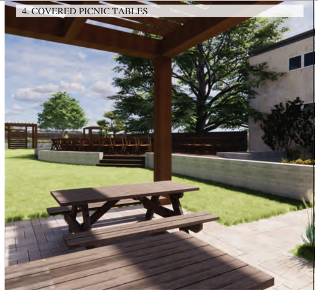
4. COVERED PICNIC TABLES