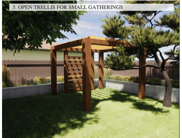
5. OPEN TRELLIS FOR SMALL GATHERINGS