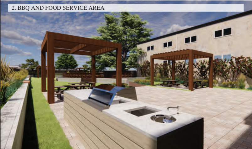
2. BBQ AND FOOD SERVICE AREA