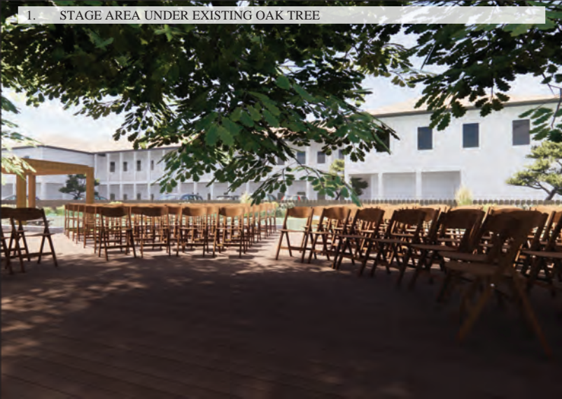
1. STAGE AREA UNDER EXISTING OAK TREE