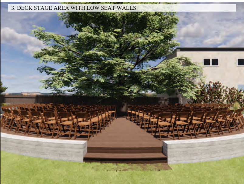
3. DECK STAGE AREA WITH LOW SEAT WALLS